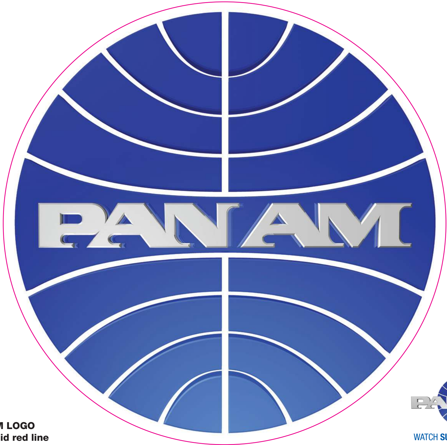
PAN AM LOGO Cut on solid red line