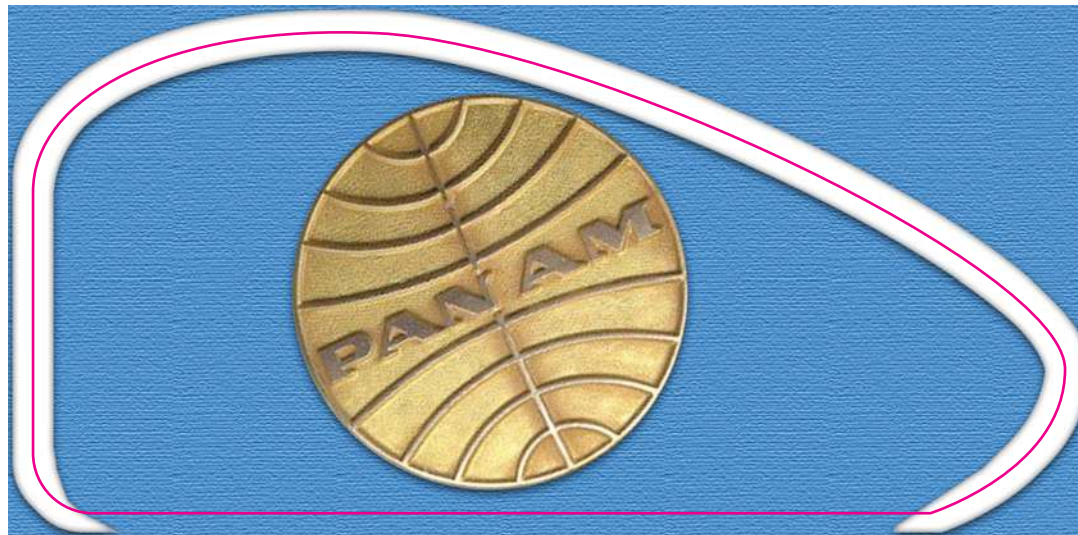
FLAP Cut on solid red line