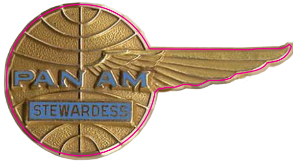
PAN AM PIN Cut on solid red line